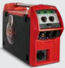
TPS/i 270 Package contents not shown

FREE VIZOR CONNECT WELDING HELMET WITH YOUR WELDING PACKAGE ORDER!*